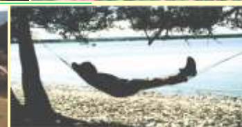
पर्वता, तिकोणा तुंग परिसर